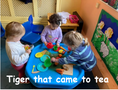
Tiger that came to tea

We have loved exploring all of our favourite stories during April. We have explored the hungry caterpillar tuff trays, been on bear hunts in the forest and so much more. Our theme will be moving onto exploring colours and learning the names of colours. We will be linking activities, tuff trays and games to this throughout May.