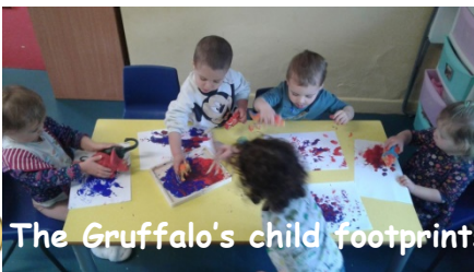
The Gruffalo's child footprints

We have loved exploring all of our favourite stories during April. We have explored the hungry caterpillar tuff trays, been on bear hunts in the forest and so much more. Our theme will be moving onto exploring colours and learning the names of colours. We will be linking activities, tuff trays and games to this throughout May.