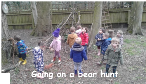
Going on a bear hunt